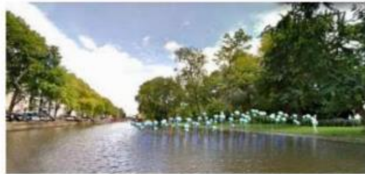
Initial renders of Pool of Dreams

The public art , however, is equally guided by the site. The chosen location for the installation, near the city centre, encompasses a section of a water canal and the adjacent land (park). This broad section of the canal accommodates boats and cruises moving in both directions. Two nearby bridges and points across the canal serve as key vantage points, offering various perspectives. Additionally, the lustrous clusters can be experienced intimately, and even interacted with, by strolling through it via the park side. The proximity of low-style Amsterdam boats and cruises passing by aided in the determination of the sizes, arrangement, and density of the mirror-finished stainless-steel spheres. “Surreal reflections in water, lights from the neighbourhood architecture and the tree density on top, all helped us define the light play and the colours. In essence, the core idea and concept evolved organically, with site considerations acting as the primary influence and guide throughout the creative process,” the artist explains.