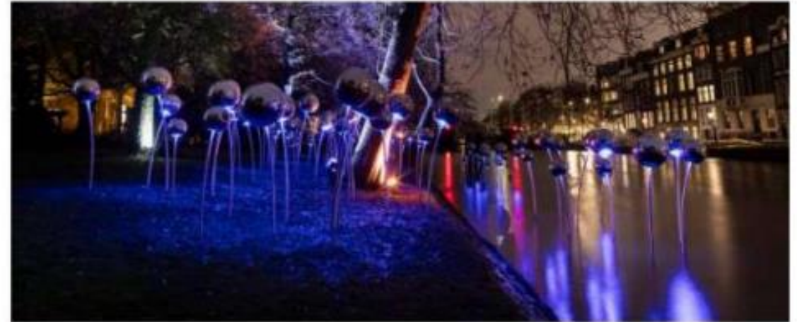
The installation can be viewed from boats or interacted with on land

Sogani, a passionate creative, has dabbled with a variety of materials, stainless steel being one of his most consistent choices for his installations. He also expresses a similar fondness for light art and the role of light in art. The illuminating energy, when it engages with his sculptural compositions, defines them and adds a final layer to their perception—a fourth dimension of art, much like it is for architecture . His renowned work titled Sprouts is one of the largest public art installations in India —40 feet high and spread across six acres of greens. Joy , another prominent work of his in Dubai, UAE , stands tall at a height of 30 feet. Pool of Dreams , the latest addition to his body of work, takes cues from the material palette and artistic vocabulary of Sogani's previous projects.